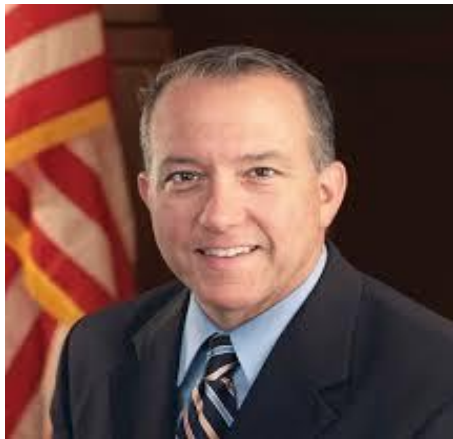
Dan Horrigan Mayor of Akron

Fall 2017 Summit County Learning Collaborative Tuesday November 14, 2017 | 8:00 am - 4:00 pm